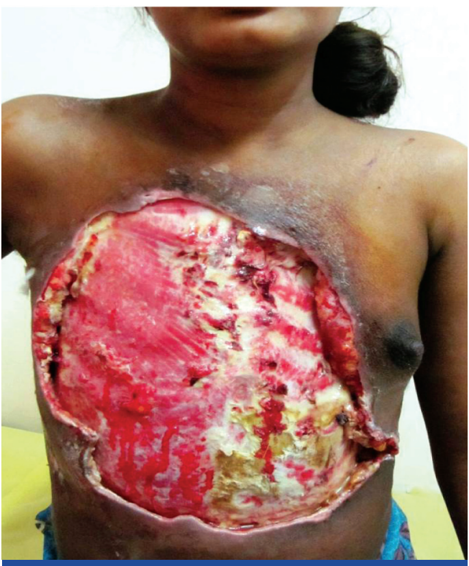
[Table/Fig-2]: Appearance of wound 48 hours after debridement

Predisposing factors include history of blunt trauma, varicella (chickenpox), injection drug use, penetrating injury, insect bites, surgical procedures, child birth, burns, DM, peripheral arterial disease, malignancy and immunosuppression [2].