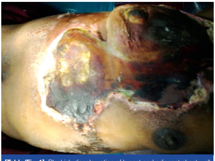
[Table/Fig-1]: Blackish discolouration of breast and adjacent chest wall

The term Necrotizing fasciitis (NF) was coined by Wilson in 1952. Necrotizing soft tissue infection (NSTI) is a rapidly progressive spreading necrotic infection of skin, subcutaneous tissue, fascia and muscle.